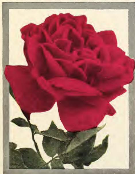
Bess Lovett. A climbing variety

SPRING, 1927 Trade-List of Lovett's Nursery Little Silver, New Jersey